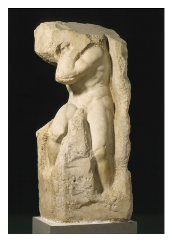
Fig. 1. Unfinished "captive" by Michelangelo Buonarroti.

Is such adaptation a good thing or a bad thing? The concept of partner affirmation describes whether the partner is an ally, neutral party, or foe in individual goal pursuits (Drigotas et al., 1999). As noted in Figure 2, affirmation has two components: Partner perceptual affirmation describes the extent to which a partner consciously or unconsciously perceives the target in ways that are compatible with the target's ideal self. For example, John may deliberately consider the character of Mary's ideal self, consciously developing benevolent interpretations of disparities between her actual self and ideal self. Alternatively, if John and Mary possess similar life goals or values, John may rather automatically perceive and display faith in Mary's ideal goal pursuits.